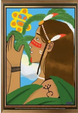
Artwork from the Online Latino Art Gallery Buffalolatinoartgallery.com

Buffalo Latino Village PO Box 742 Buffalo, NY 14209