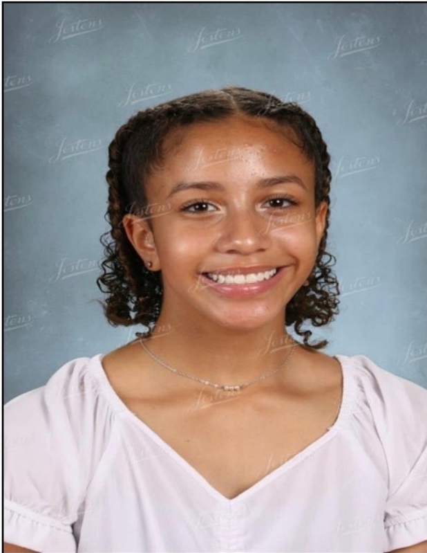
"DIVERSITY" GIA CLARICE